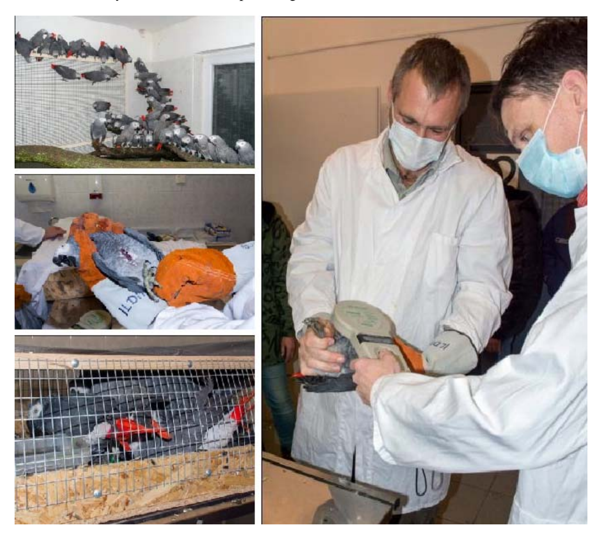
Zoo. Plastic closed rings were most probably used to launder the birds as captive bred, but those could easily be removed and replaced again.