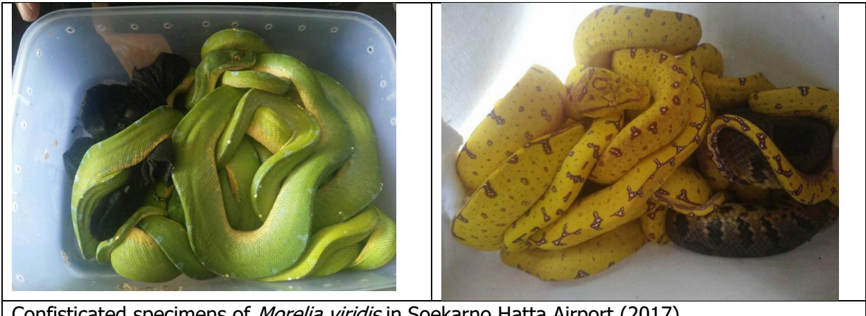
Confisticated specimens of Morelia viridis in Soekarno Hatta Airport (2017)