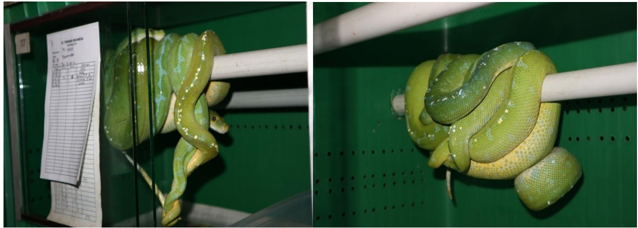
Courtship and Copulation of Morelia viridis