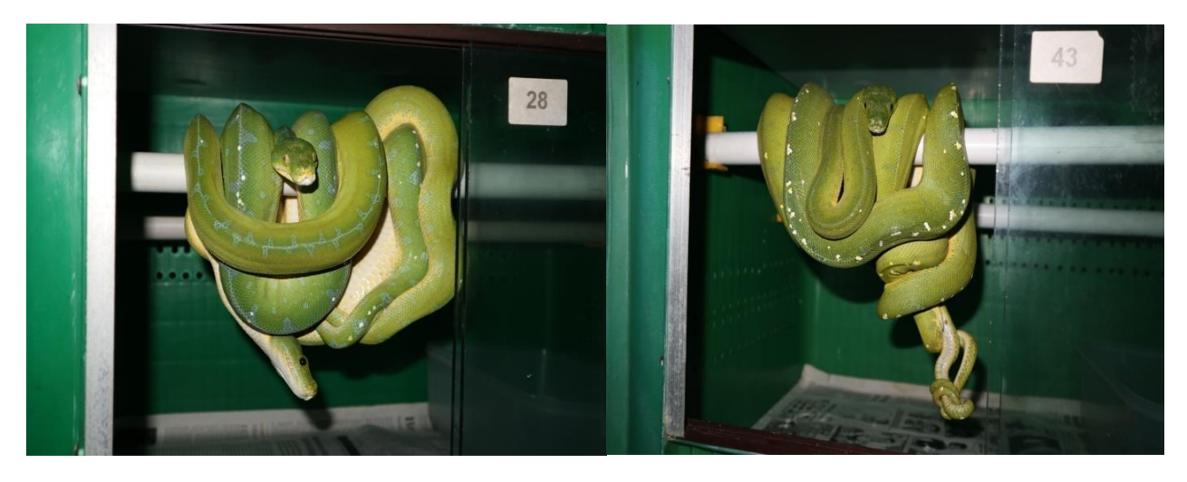
Courtship and Copulation of Morelia viridis