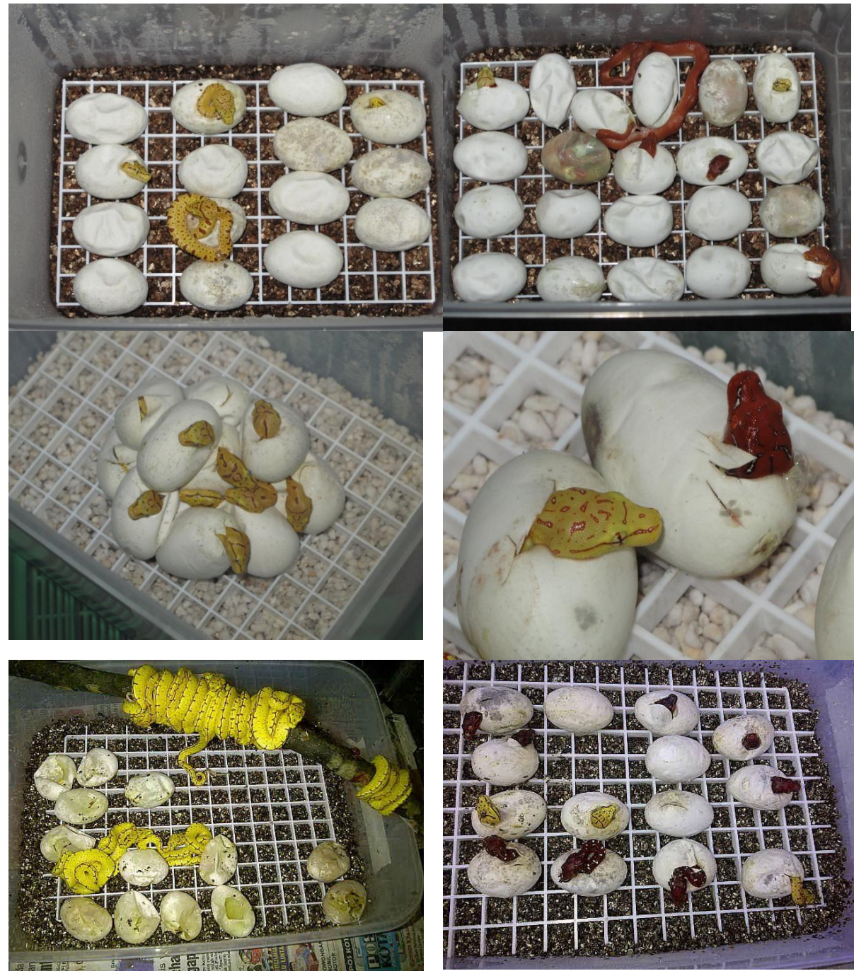
Hatchling Morelia viridis

For monitoring, the CITES Management Authority (MA) designed a tool to control and monitor the production of a company namely Maximum Estimated Production (MEP). MEP is an estimate of breeding success for a particular species, by a particular breeder over a forthcoming 1 year period. Each breeder has to submit MEP of this species and then the CITES MA subsequently checks those claims, taking into consideration the previous breeding success of the company, and the biological of the species concerned.