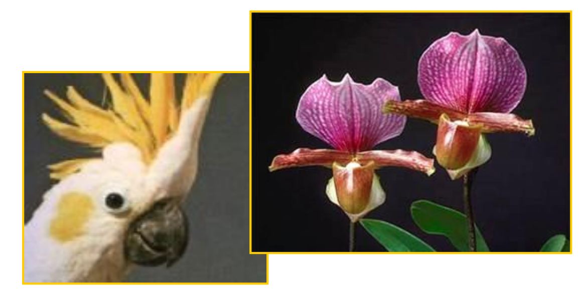
* Live, dead, parts, and derivatives