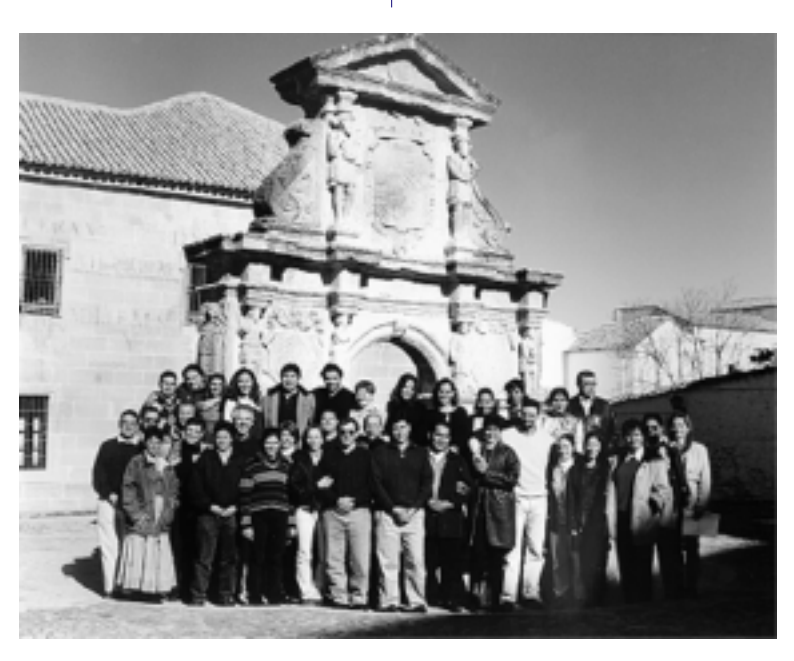
Second master course: participants

topics that are necessary for CITES to be properly implemented. The practical training took place at the Botanic Garden/University of Cordoba, the Barcelona Zoo, the Je-Zoo, rez the Customs Office of Algeciras, Cazorla Natural Park, Doñana National Park and the University of Granada. All students passed the final exam and they are preparing their thesis in their respective countries.