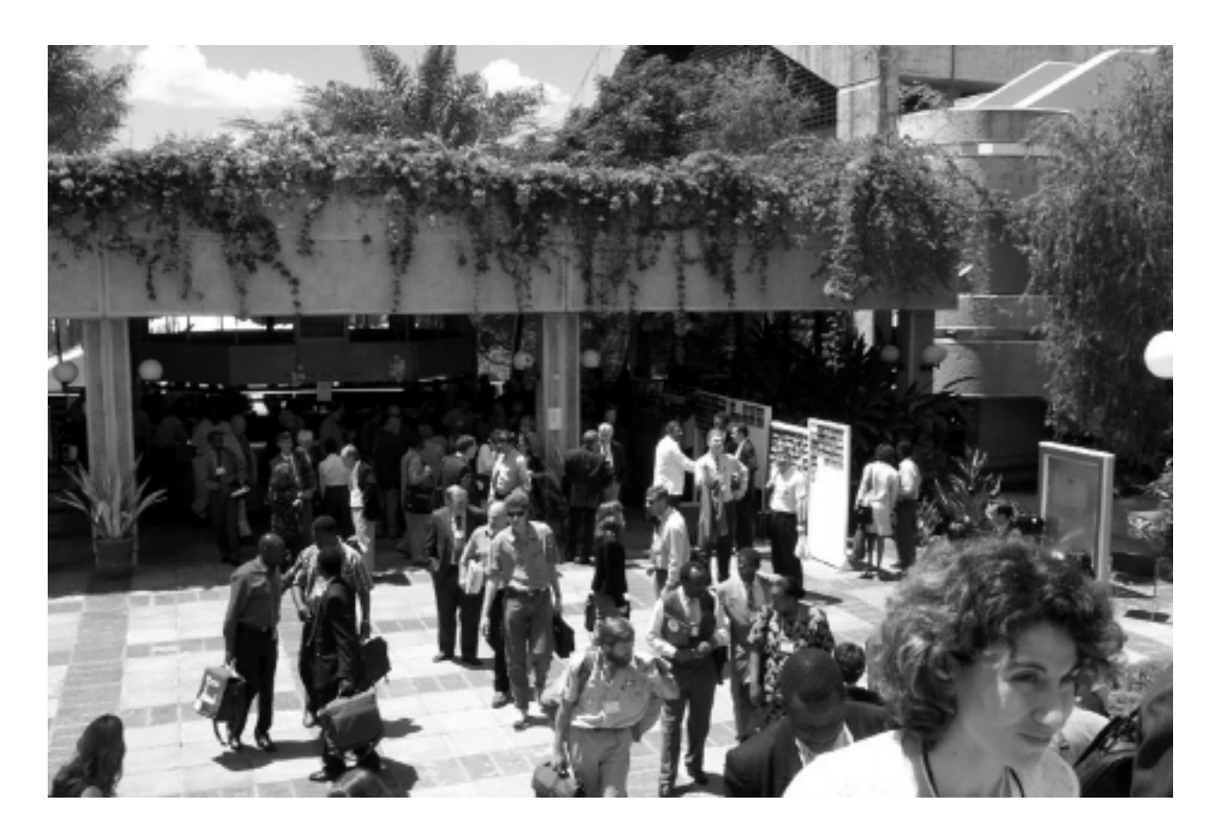
Between sessions the discussions continued