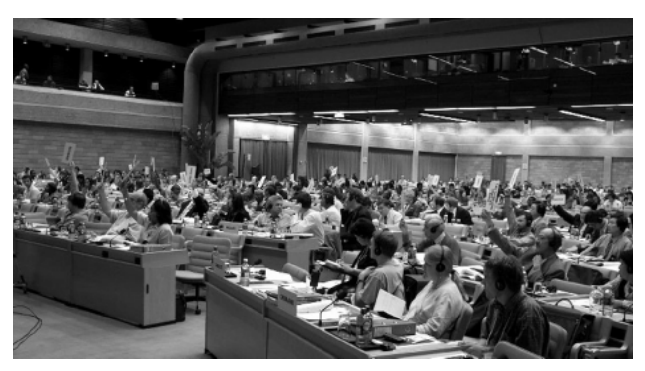
Vote during Committee I