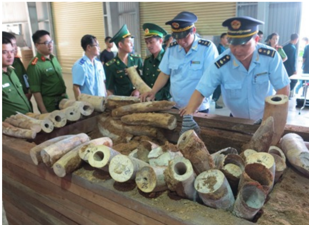
Functional forces in Da Nang examined smuggled ivory shipments.

On June 15, 2019, the Environmental Police coordinated with functional forces to seizure 3 containers of 9,124kg of ivory at Da Nang Port, the case have been under ongoing investigation, and criminal prosecution. The video of the case can be viewed at the link: https://www.youtube.com/watch?v=pVttbv76SIk