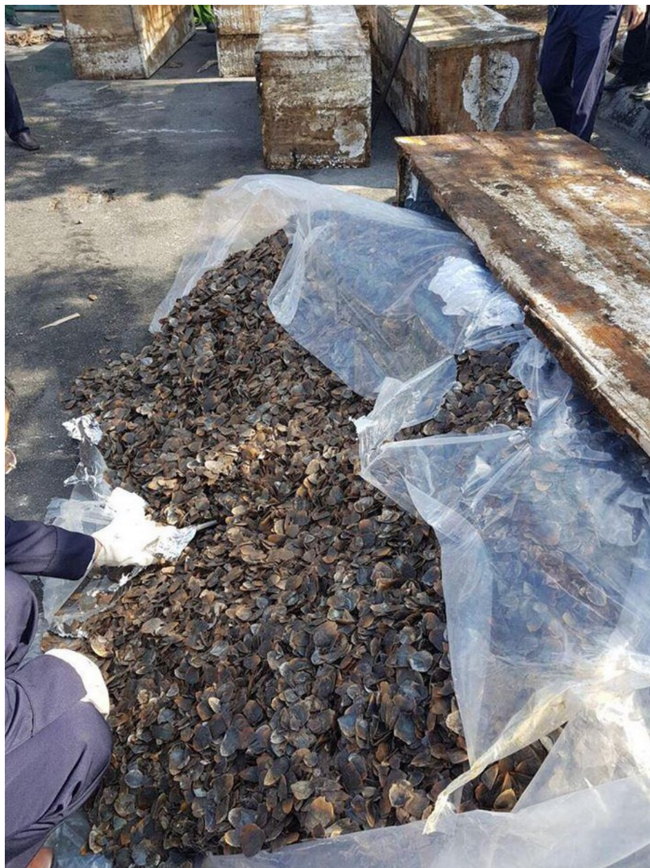
Pangolin scales hidden in the seized wood in Hai Phong

- On 31/01/2019, Customs in Hai Phong City seized over 1 ton of pangolin scales from Apapa – Nigeria.