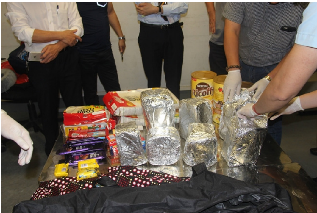
Rhino horns seizure at Noi Bai International Airport on April 11, 2019

- The Criminal Code is strictly applied, for example, the 3 carriers illegally transporting 20.5 kg of rhino horn were arrested by Police in Lao Cai province in May 2018. The Court sentenced three carriers from 8 years 6 months to 10 years 6 months in prison, the total penalty for 3 carriers is 27 years in prison.