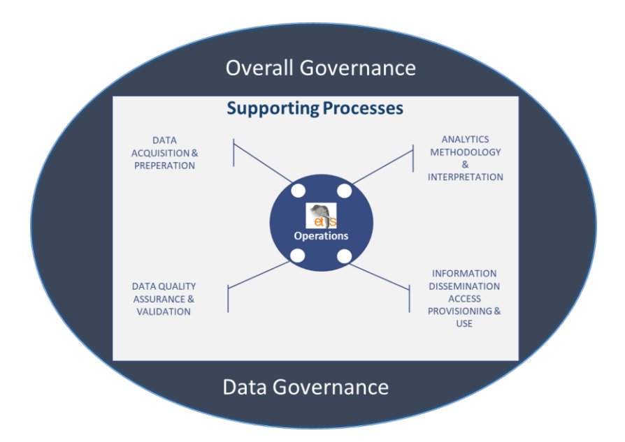
Figure 1: Overall Governance Construct