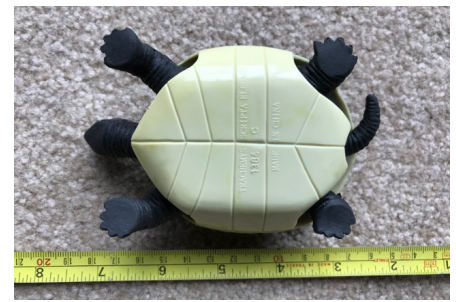
View of the plastron (underside of the shell)