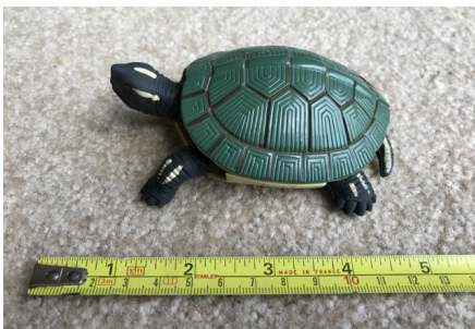
View of the whole animal more or less from the side

For the great majority of tortoise and freshwater turtle species, 3 pictures of good quality are sufficient for reliable identification: