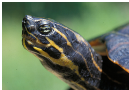
Close-up of the head