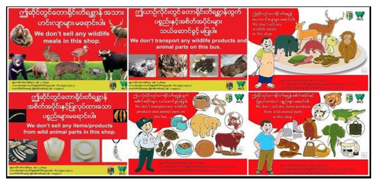
Figure 4: Wildlife Campaign materials in Myanmar