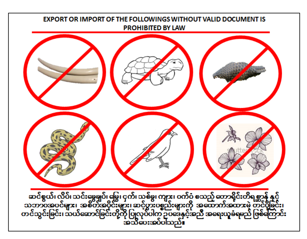
Figure 10: Board shows forbidden wildlife products to be transported at the airport