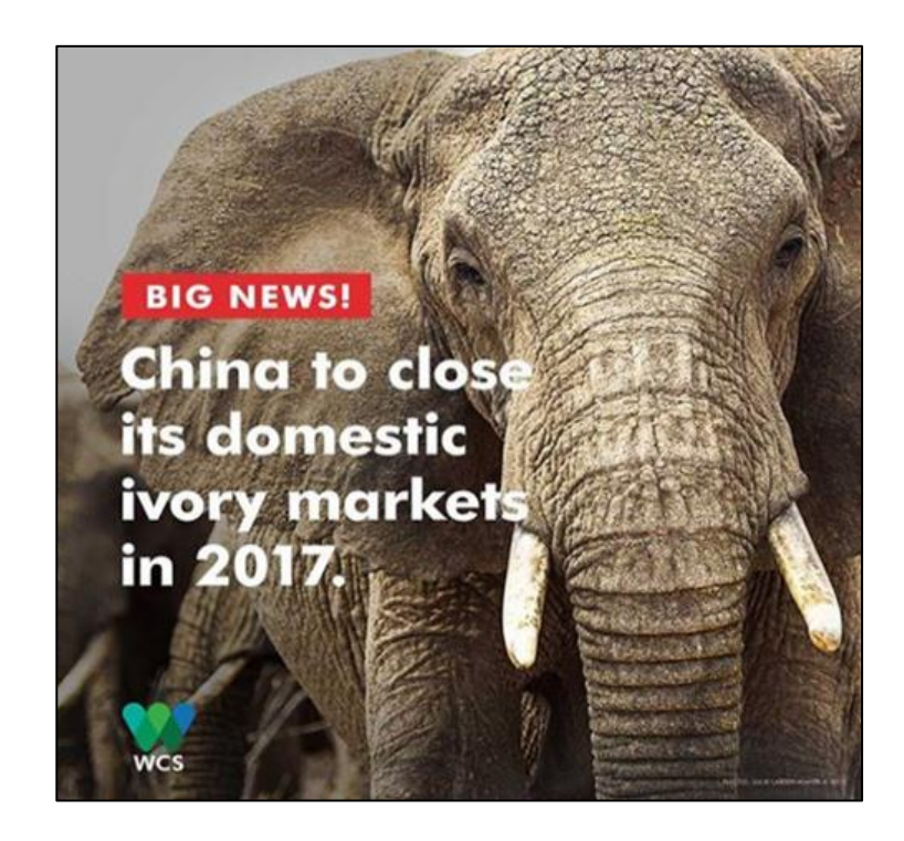
Figure 8 : China is to phase out domestic elephant ivory trade by the end of 2017