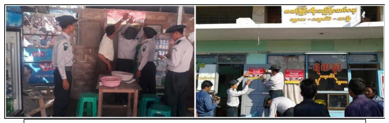
Figure 3: Demand reduction campain and inspectin activities on wildlife in Myanmar