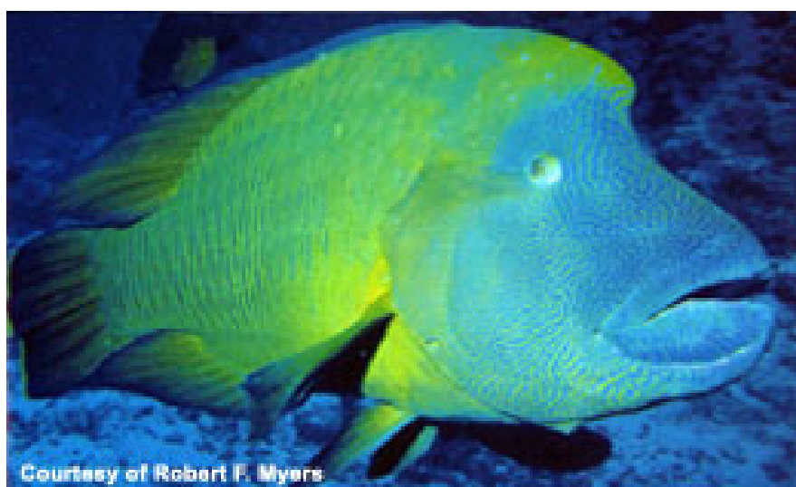
Large adult with distinctive humphead