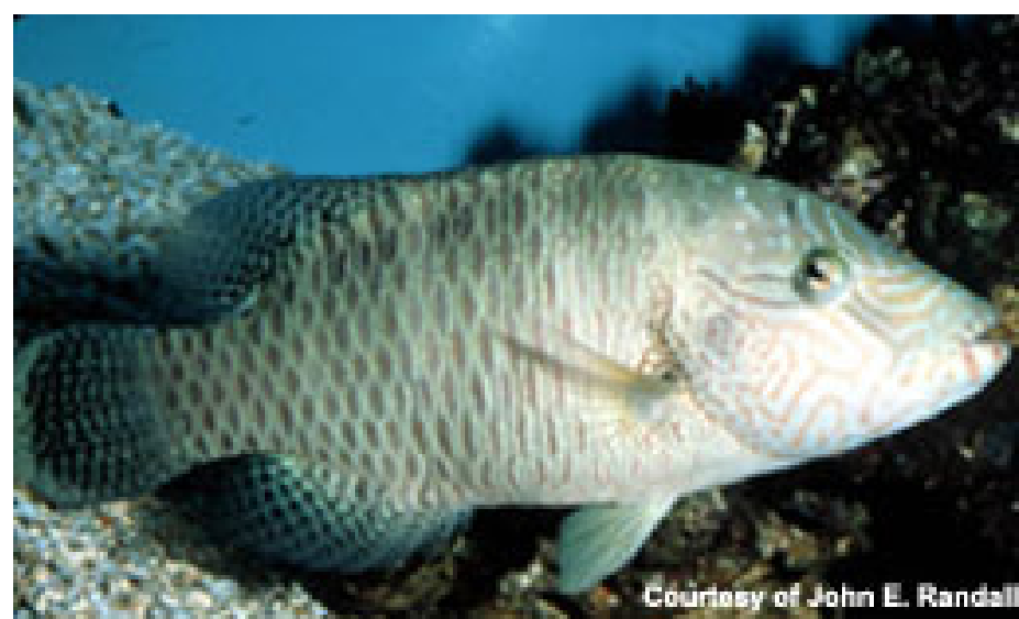
25 cm long juvenile live inshore

Please visit www.ava.gov.sg ( Endangered Animals section) or contact AVA at tel: +65 6805 2992 for more information.