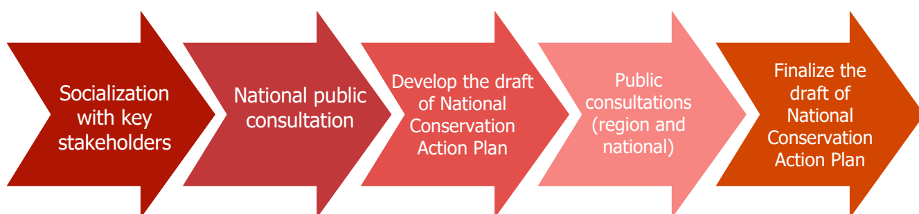
Figure 1 Stakeholders involvement and process in SRAK development

In compliance to aforementioned CITES Resolution and with regard to Decisions 17.264 and 17.265, Government of Indonesia has started the development of National Action Plan and Conservation Strategy for Helmeted Hornbill, which will be valid for ten years. Ministry of Environment and Forestry as CITES Management Authority in Indonesia is working closely with