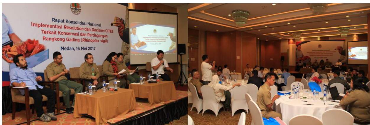
Figure 2 Consultation public held in Medan

April 2017 marked as the beginning of CITES resolution implementation for helmeted hornbill in Indonesia (Figure 2). The first national public consultation has successfully held on May 16 th 2017 in Medan Sumatra, which is known as one of the critical exit points for helmeted hornbill. As a result, comprehensive data on population, habitat, trade, seizure and confiscation cases of helmeted hornbill are collected, and information on hopes and worries related to helmeted hornbill from various stakeholders are also recorded.