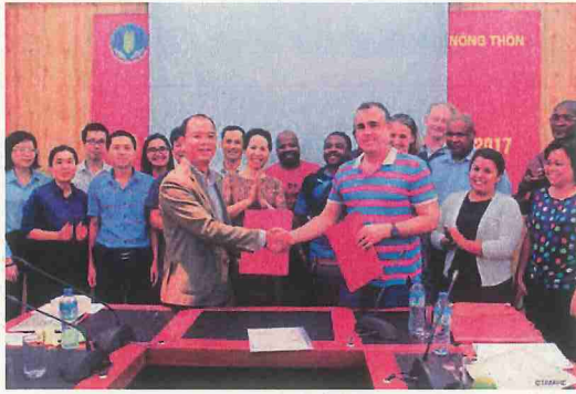
Review of the implementation of Viet Nam – South Africa on Biodiversity conservation