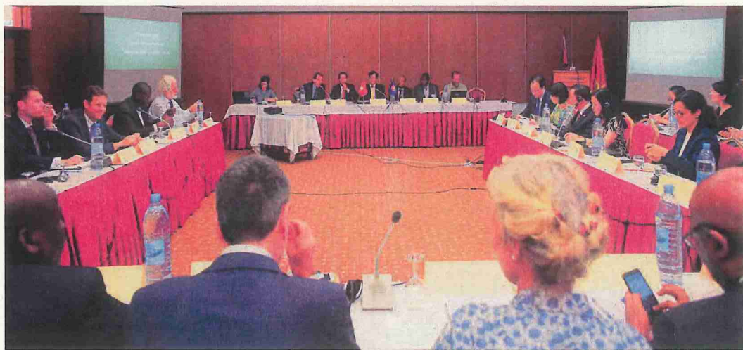
Workshop on Legal Assistance in the field of combatting against illegal wildlife trade between Vietnam and Mozambique

- During 2017, Vietnam and the Republic of Czech jointly produce a propaganda leaflet on changing the perception of the Vietnamese community (living and working in the Czech Republic) with the theme: “DO NOT PURCHASE - DO NOT SELL RHINO HORNS”.