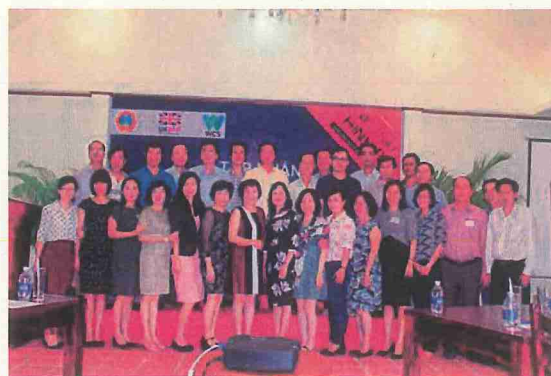
Training for judges in Phu Quoc, Kien Giang

The Penal Code has been published on government gazette and has been released to provinces and central cities for guidance.