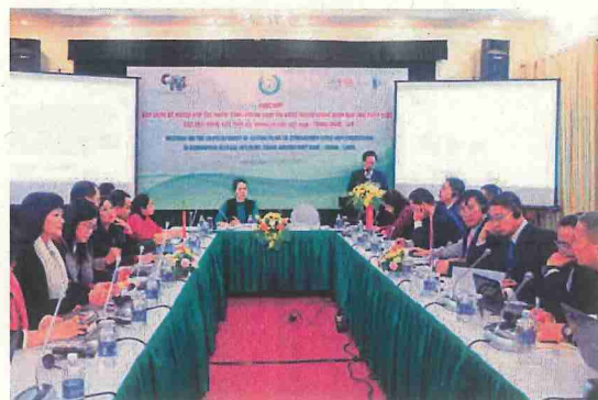
Viet Nam – Laos – China meeting on cooperation in CITES implementation