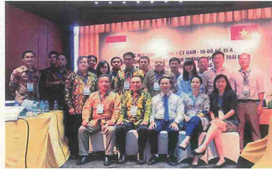
Viet Nam – Indonesia 6 th bilateral meeting on strengthening cooperation in combatting against illegal wildlife trade