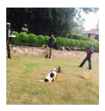
Photographs above show one of the sniffer dogs acquired undergoing training demonstration on how to sniff ivory. The dogs have already been deployed at Entebbe International Airport