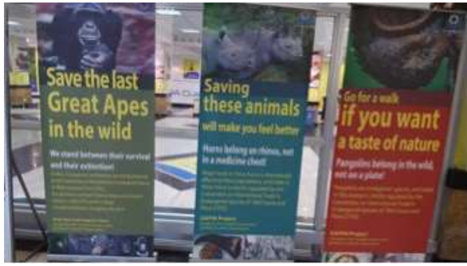
Photograph above shows one of the awareness creation materials produced by Uganda in collaboration with other partners and placed at the International Airport to warn the passengers against wildlife trafficking