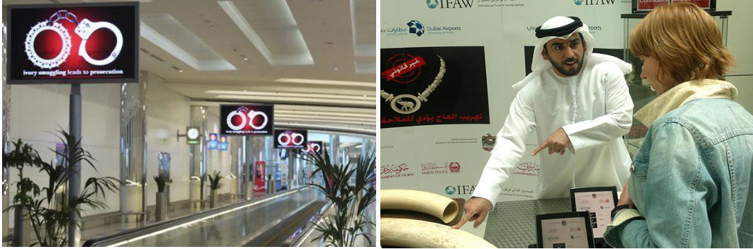
Picture (2): Part of the “Ivory smuggling leads to prosecution” campaign held in Dubai Airport in 2014 in association with IFAW, Dubai Police, and Dubai International Airport.

Instagram and Facebook. In 2015, a similar campaign was conducted in Abu Dhabi Airport in cooperation with IFAW, Abu Dhabi Police, Abu Dhabi Customs and Abu Dhabi Airport.