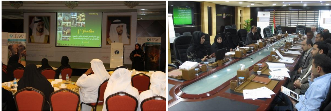
Picture (2): Showing two different sessions of different training workshop conducted in 2015