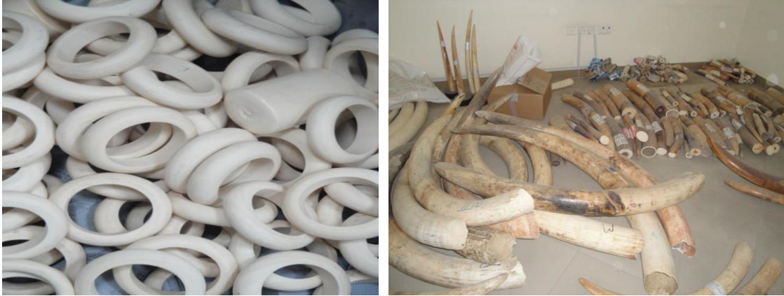
Picture (1): Showing part of the ivory stock at the Ministry's warehouse in 2014

were removed, i.e. 800 sites. The External Audit Department in the Ministry in coordination with the local environmental authorities conduct many inspection programs on pet shops and the related businesses, and take appropriate action against the violator of CITES legalization.