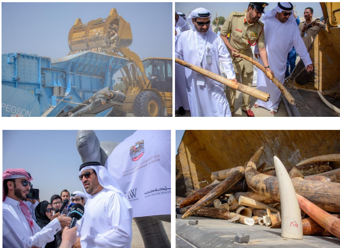
Picture (4): Ivory destruction event held in Dubai, April 2015, in cooperation with Dubai Municipality, Dubai Customs, Dubai Police and IFAW