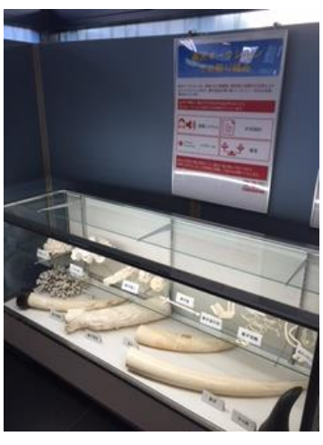
Panel and Banned Items