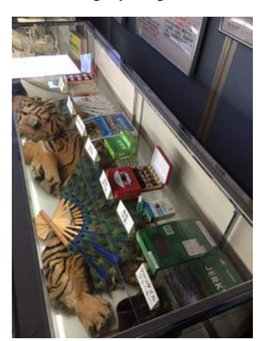
Display of Banned Items