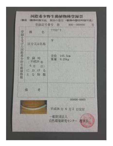
The registration card for each registered tusks

C) The following table shows the registered number and weight of whole tusks as of the end of July 2015. The number in the brackets shows the one Japan reported to the CITES Secretariat in February 2015. A public awareness activity on domestic trade rules may be considered to be one of the reasons of increasing the number of registered ivory, since some private owners of "Pre-Convention" ivory, may consider it useful to register them for future transfer.