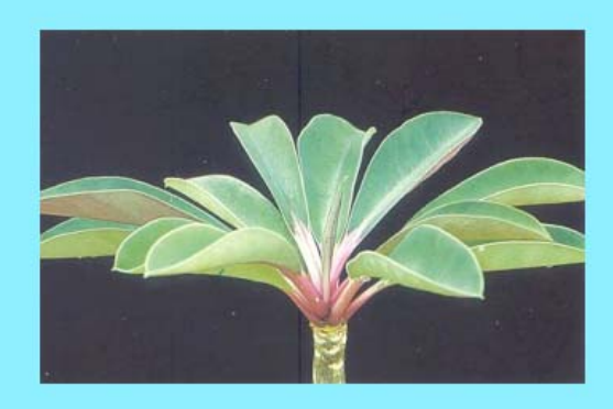
Retain E. bongolavaensis