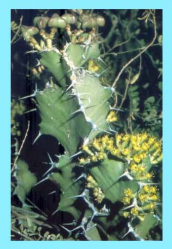
Retain E. cactus