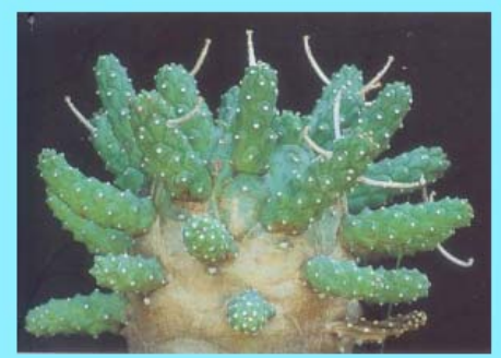
Retain E. crassipes