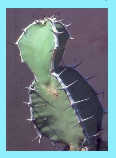
De-list E. strangulata