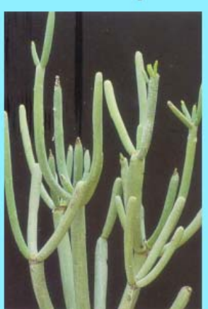
De-list E. aphylla