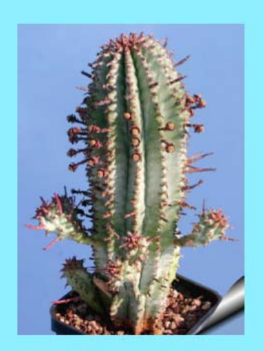
De-list E. submammilaris