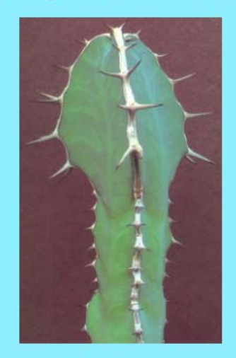
Retain E. cactus