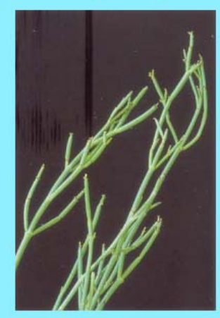
Retain E. burmannii