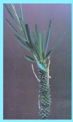
Retain E. monteroi