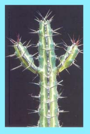
De-list E. serendipita