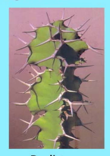
De-list E. grandicornis