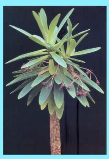
<u>De-list</u> E. bravoana