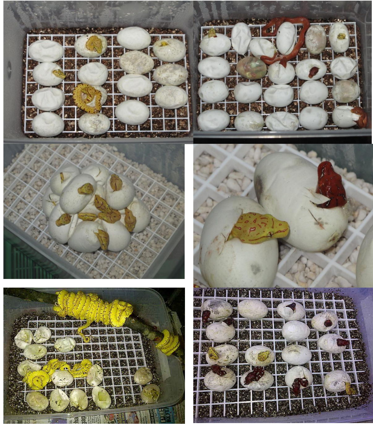
Hatchling Morelia viridis

For monitoring, the CITES Management Authority (MA) designed a tool to control and monitor the production of a company namely Maximum Estimated Production (MEP). MEP is an estimate of breeding success for a particular species, by a particular breeder over a forthcoming 1 year period. Each breeder has to submit MEP of this species and then the CITES MA subsequently checks those claims, taking into consideration the previous breeding success of the company, and the biological of the species concerned.