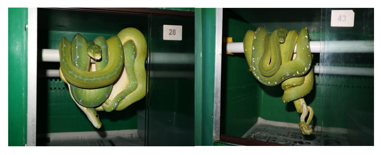
Courtship and Copulation of Morelia viridis