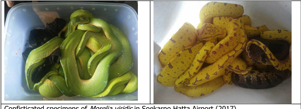
Confisticated specimens of Morelia viridis in Soekarno Hatta Airport (2017)