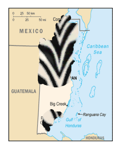
Figure 3 : Current distribution of Dermatemys mawii in Belize Map obtained from the presentation by the Authorities of Belize at the 2006 tri-national workshop