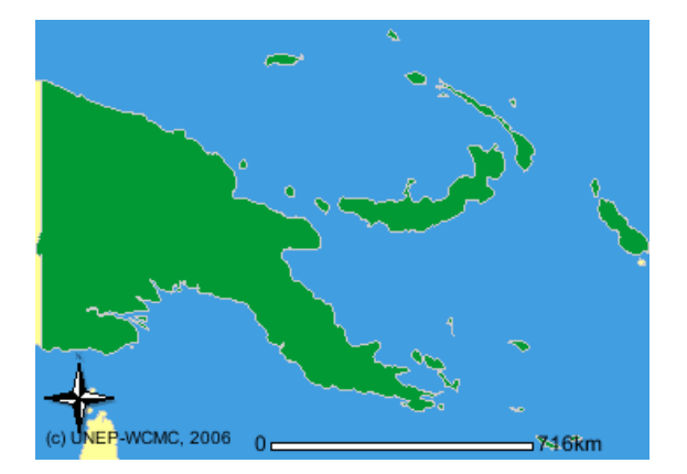
Range of Ornithoptera alexandrae , according to UNEP-WCMC. The only country, in green, is Papua New Guinea.

Ornithoptera alexandrae has only one range State: Papua New Guinea.