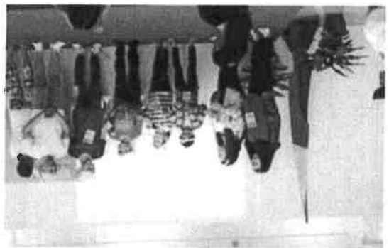
Annex 2 Fig. 8