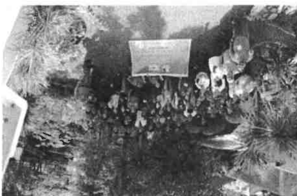
Annex 2 Fig. 5