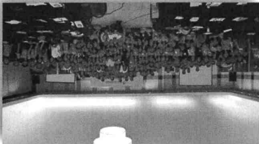
Annex 2 Fig. 1