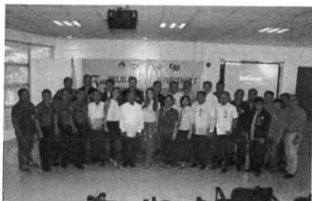
Annex 2 Fig. 6