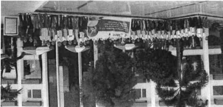
Annex 2 Fig. 3