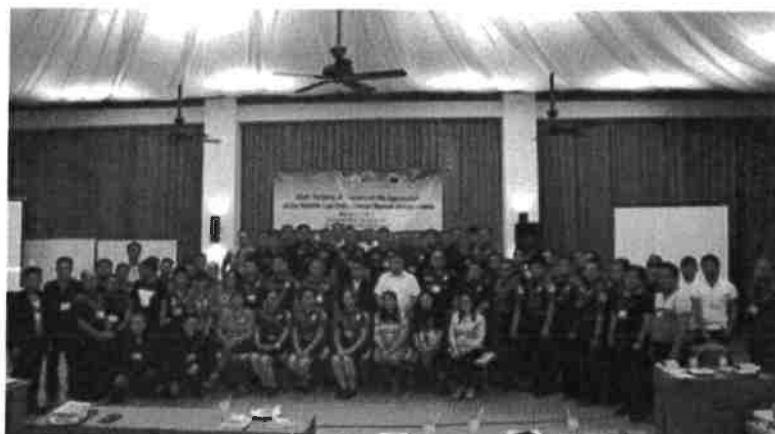
Annex 2 Fig. 2