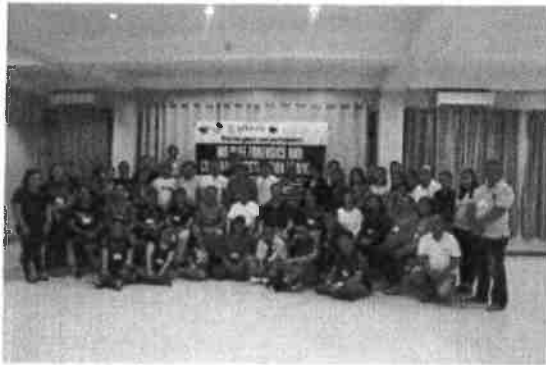
Annex 2 Fig. 4