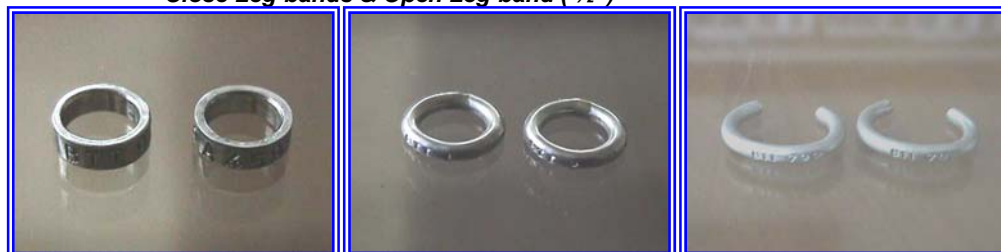
Close Leg-bands & Open Leg-band ( 1/2")

An open stainless steel leg-band is attached additionally to a female captive bred-progeny after surgical sexing. This will clearly identify the surgically sexed female because it is fitted with two leg-bands, a closed band on the right foot and an open band on the left.