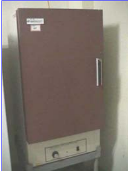
Mechanical Convection Incubator