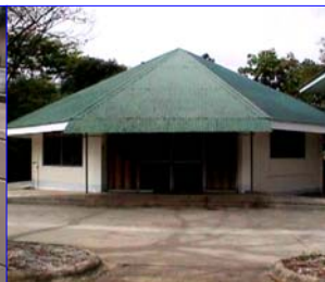
Water Filtration/ UV Light Treatment & Storage