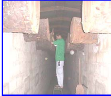
Nest Box-Outside View (Alley)