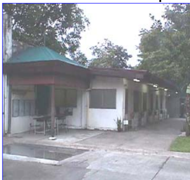
Hospital I & II